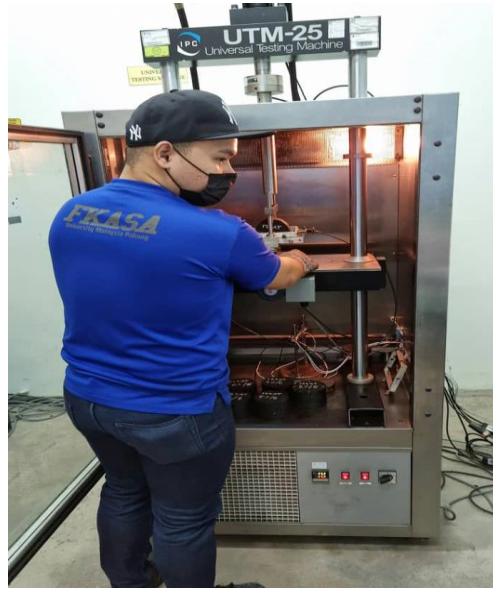
Resilience modulus test