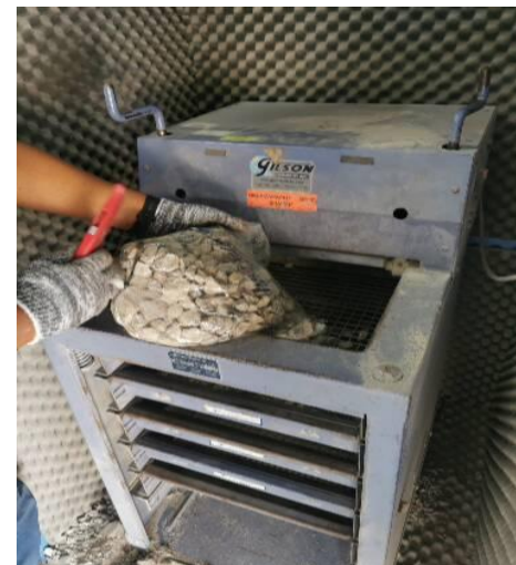
Heavy duty sieve shaker