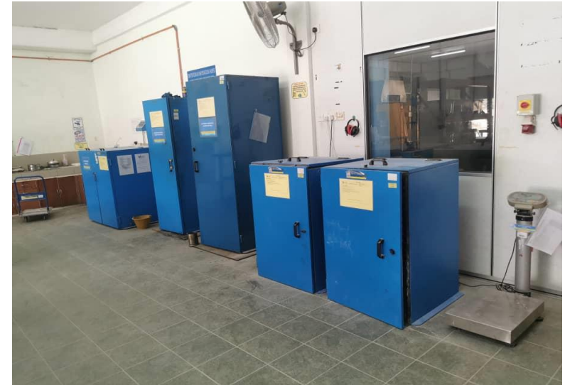
Sieve shaker, compactor & LA Machine