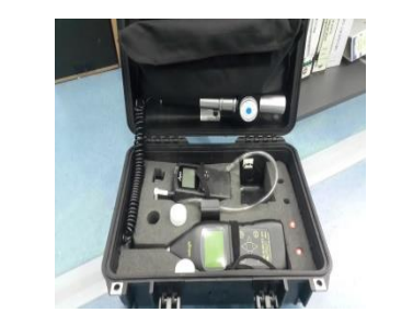
PORTABLE AIR SAMPLER